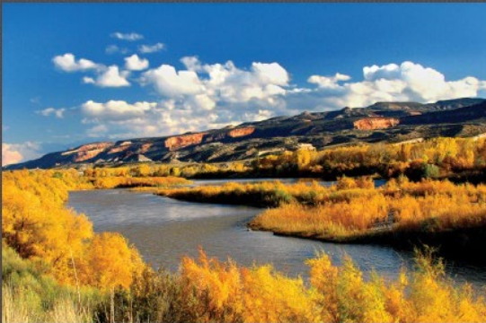
Colorado River

Guidelines for Riparian Restoration along the Colorado and Gunnison Rivers in Mesa and Delta Counties