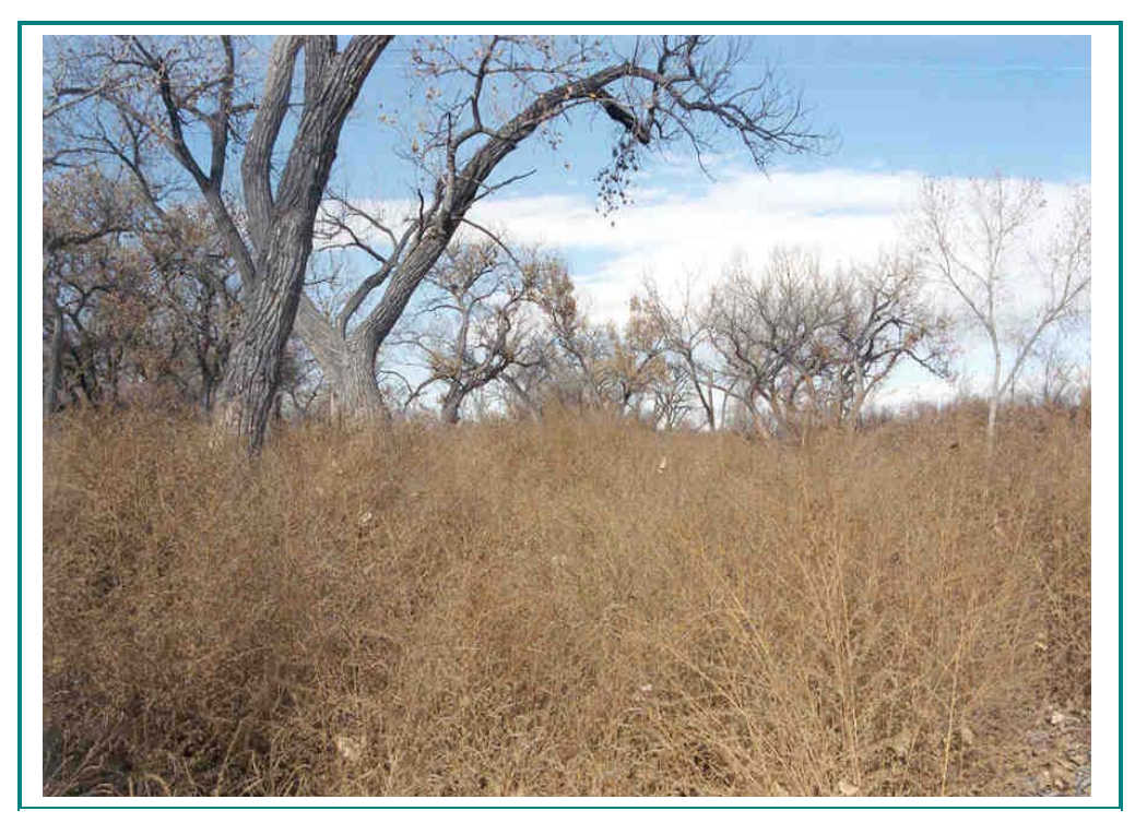
This photo shows a dense stand of the annual weed Kochia that proliferated after the removal of saltcedar in the Middle Rio Grande Bosque.