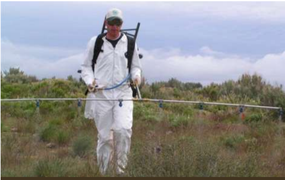
Money spent on prevention can provide excellent returns on investment when you consider that every dollar spent on early intervention saves $17 dollars in later expenses.

the people, the environment, and the challenges or limitations they face. WPAs give community members the opportunity to apply their knowledge to create an effective program by developing a plan and deciding how to implement the plan to keep infestations from advancing. The result is a prevention program that