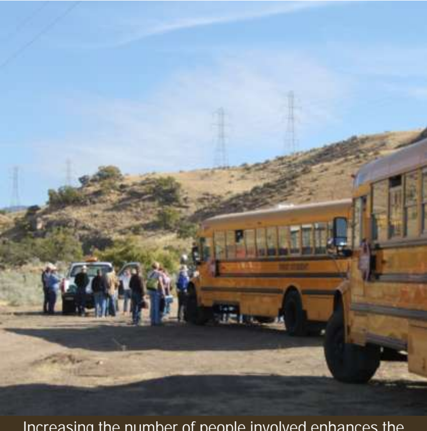
Increasing the number of people involved enhances the WPA's education and awareness efforts.

Projects that are developed that incorporate a cooperative, teamtype effort generally are successful and contribute to the overall success of a WPA. There are many ways to insert weed awareness programs and are great avenues to encourage community service projects.