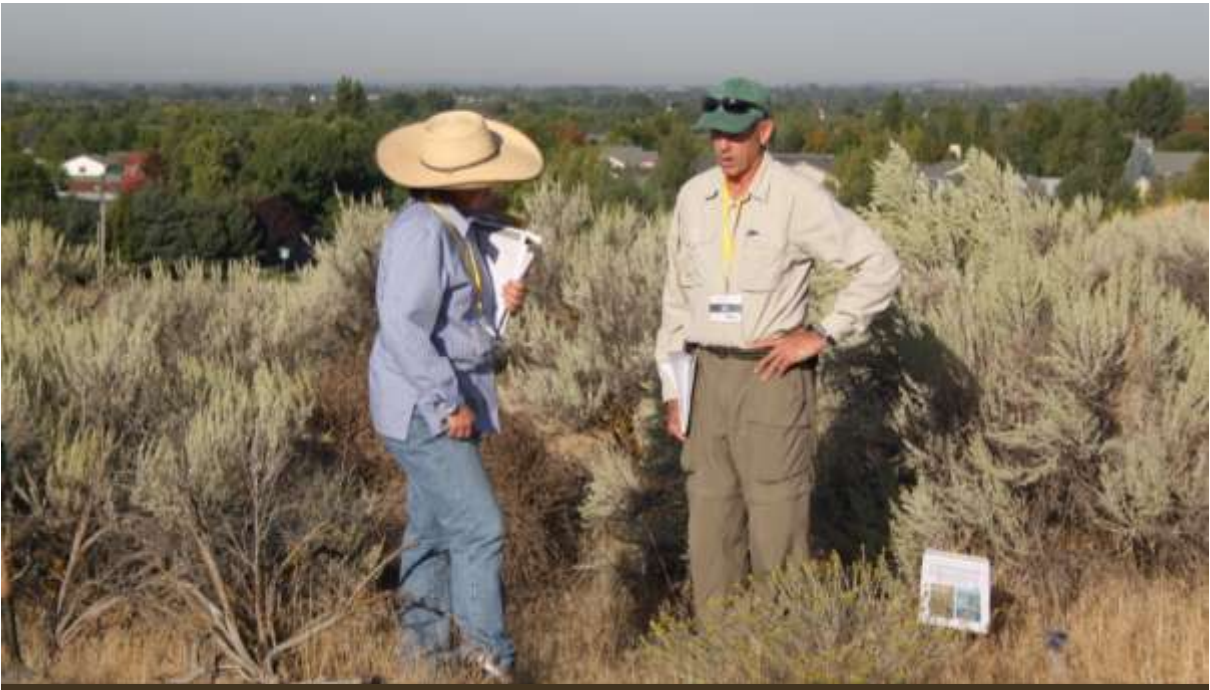
It's important to make sure all individuals involved in mapping agree on how the data will be collected, recorded, and reported .

Although every situation is different, there are basic elements to help ensure that quality weed data is collected. Outlined briefly on the following pages are several components of Utah State University's Wildland Weed Mapping Methods developed by Andersen and Dewey (1). No matter what mapping method is used, consideration of these basic components helps in the development of a weed mapping program.