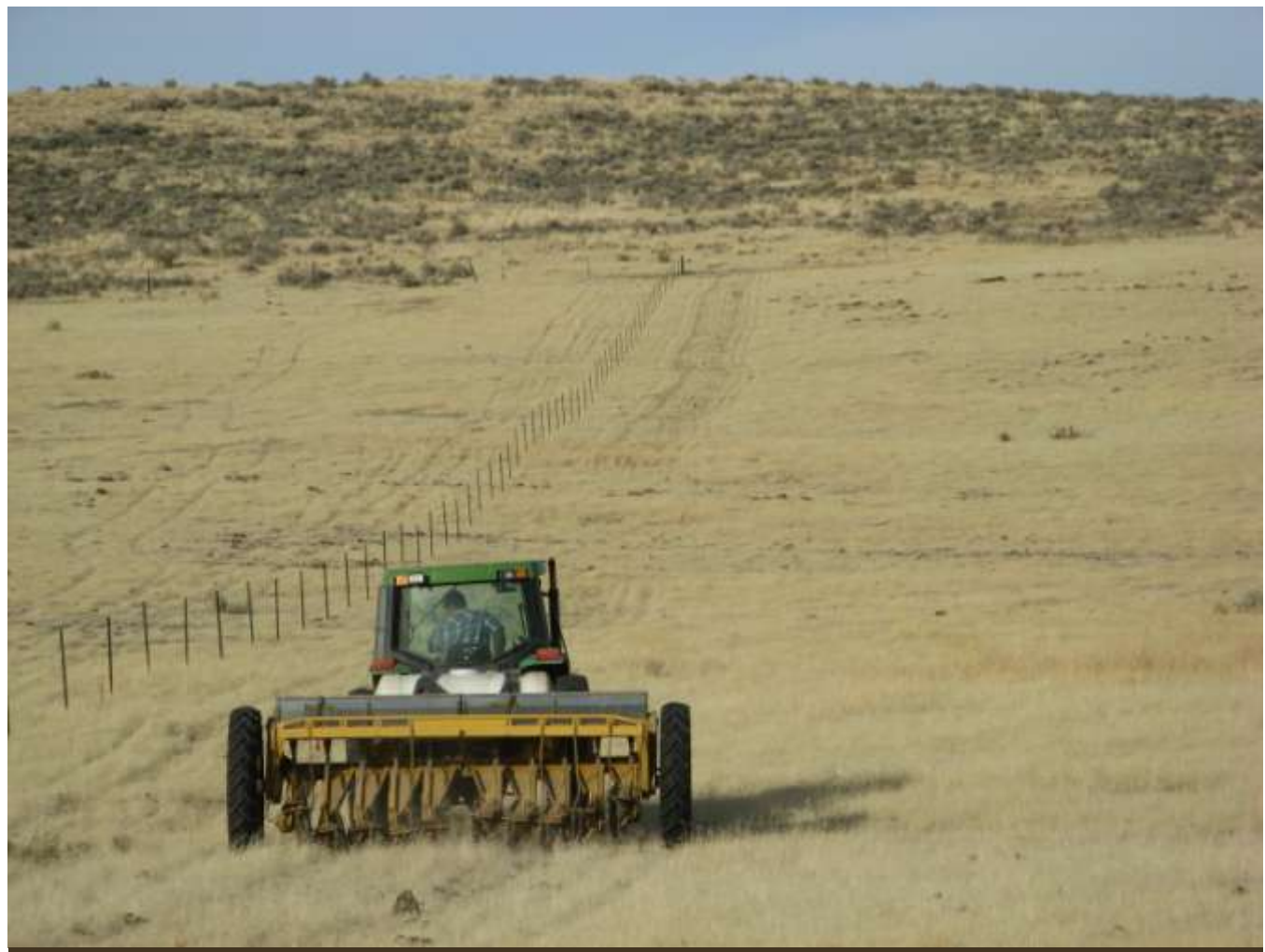
The primary difference between a CWMA and a WPA is the focus. The focal point of a Cooperative Weed Management Areas is, as defined by its name, management, while a Weed Prevention Area's focus is to prevent the need for that management.

Holding meetings in a participatory style increases the discussion of ideas and builds cooperation between individuals and/or groups. This format gives people the chance to share ideas, ask questions, and get involved. Consider having the meeting facilitated by