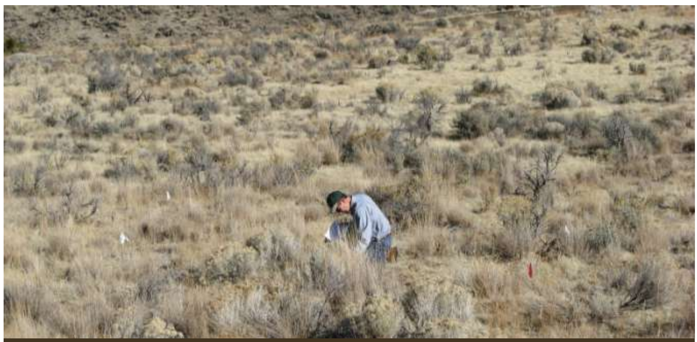
Regardless of the technique used to collect weed data and begin mapping the infestations, the sooner you can start collecting that data and preventing weeds, the better.

Other information can be collected for monitoring purposes, but the cost of mapping per acre increases as the level of detail required increases. In addition, the simpler the