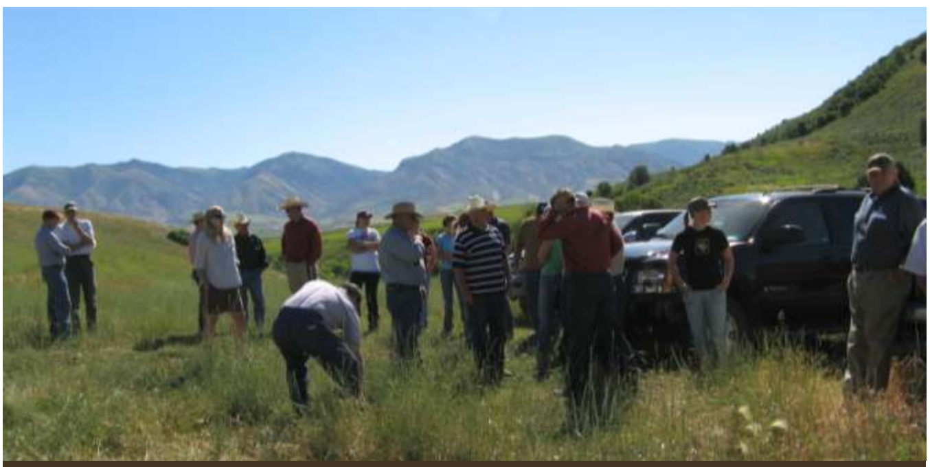
One of the most important keys of a WPA is to involve people in the community as much as possible. The more individuals that get involved, the lighter the load for each of those individuals.

WPAs can be part of, or organized similarly to, a Cooperative Weed Management Area (CWMA), but focus is placed on