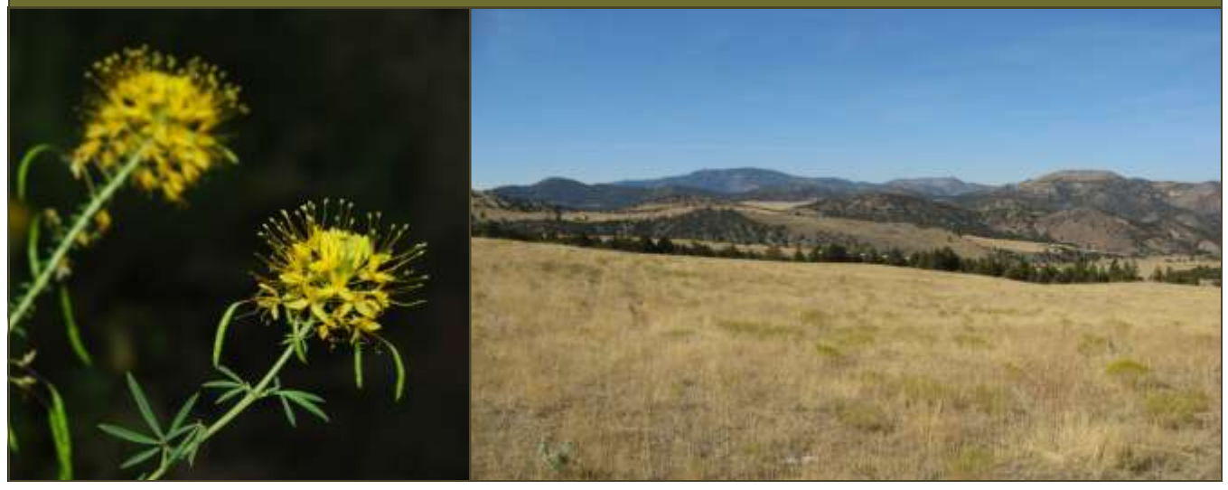
Step 3: Develop the Action Plan - 29

USDA. National Agricultural Library. National Invasive Species Information Center. Plants. Management. <u>http://www.invasivespeciesinfo.gov/plants/control.shtml</u>