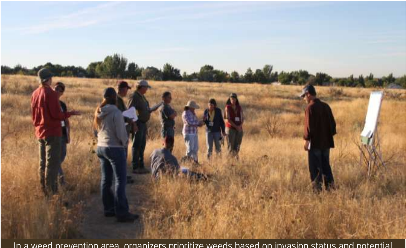
In a weed prevention area, organizers prioritize weeds based on invasion status and potential economic and environmental damage specific to their particular situation.