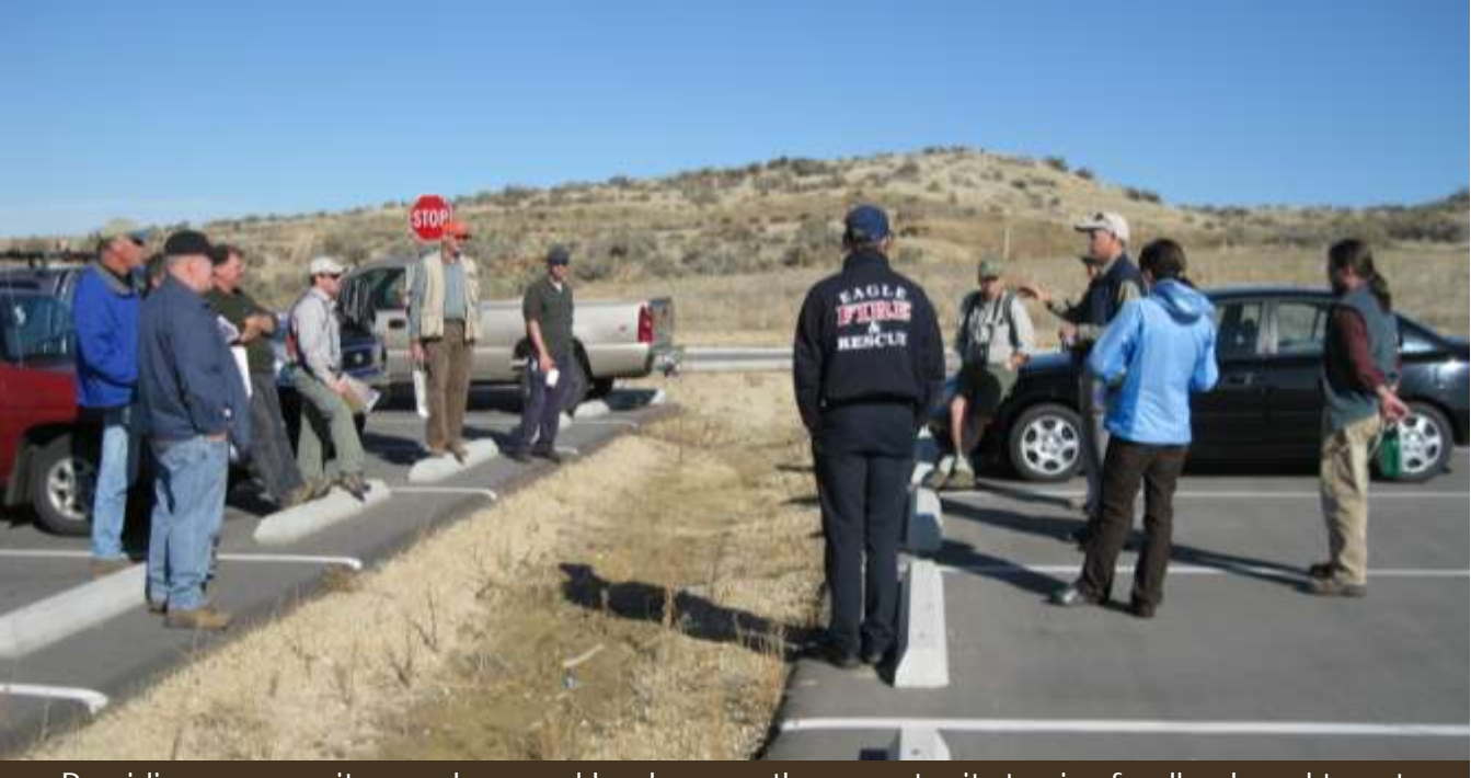
Providing community members and landowners the opportunity to give feedback and to get involved in developing the action plan will lead to better participation in implementing the plan.

Monitoring weed infestations and keeping good records are a vital part of any