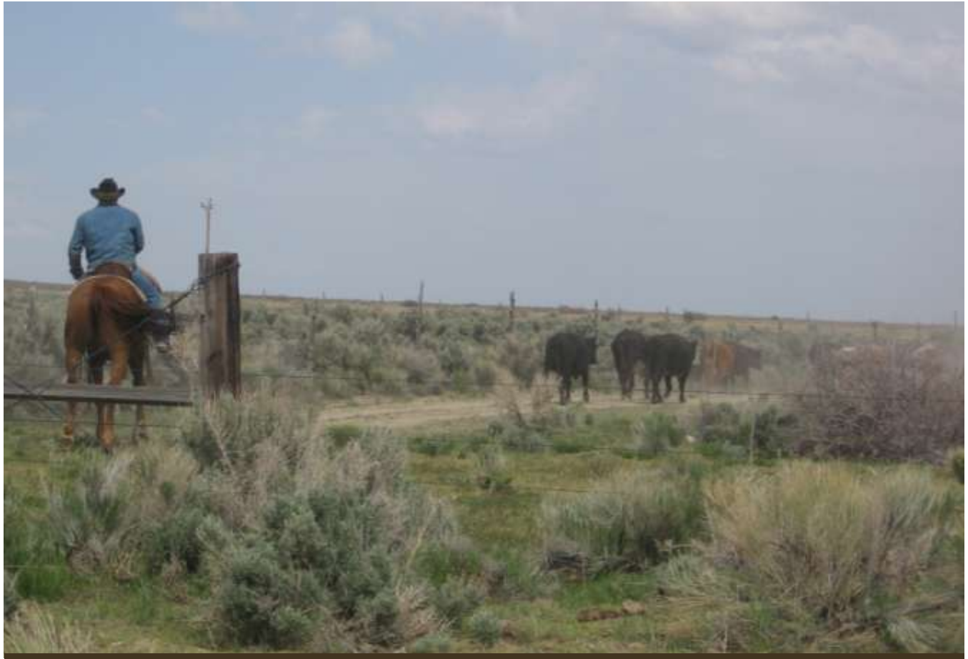
One of the major benefits of prevention is that it can be accomplished at the same time as other work.