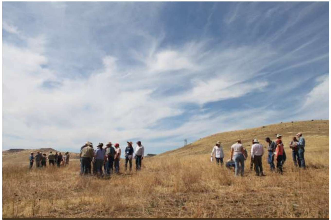
Field tours are an excellent way to get community members and landowners out to see the land and some of the problems with invasive plants. It also gives them an opportunity to share knowledge and evaluate the effectiveness of their efforts in a WPA.

developing ranch/farm weed management plans with landowners.