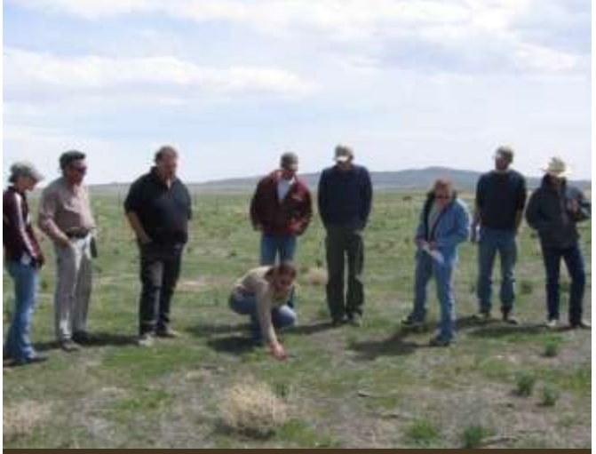
Evaluating the effectiveness of a WPA on a short and long-term basis can help lead to short and long-term success of weed prevention.

The long-term effectiveness of the WPA will require several years to document. After the WPA has collected several years' worth of