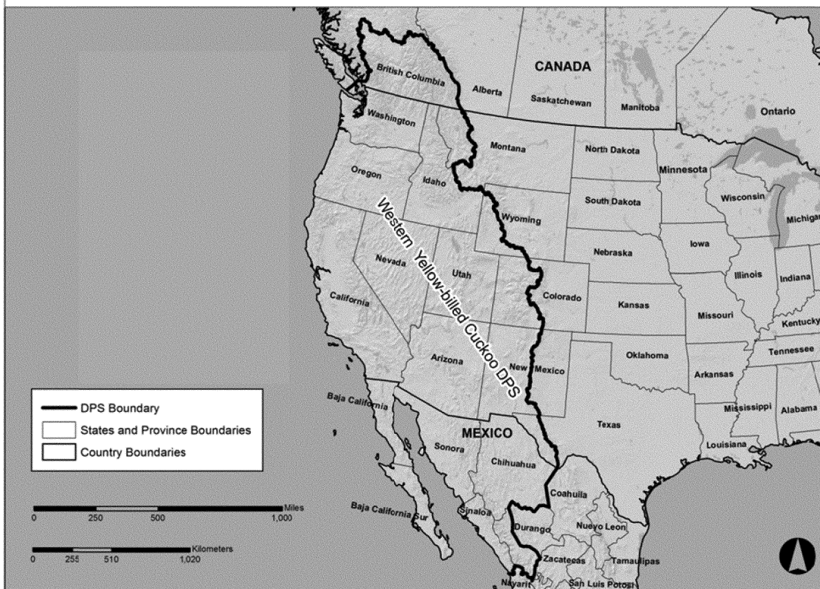
Figure 2. Western Yellow-billed Cuckoo distinct population segment boundary.