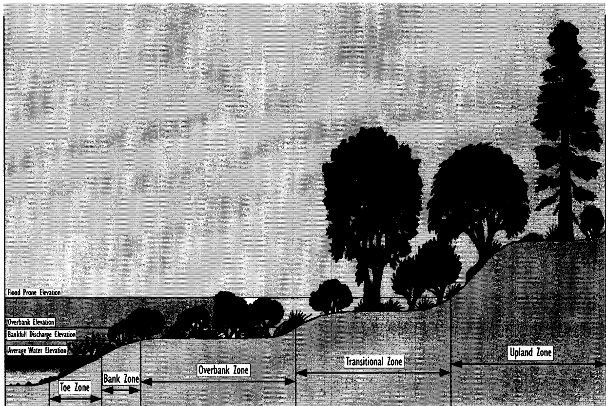
Figure 1. Riparian planting zones are based on elevations associated with different water levels and velocities. Specific types of riparian vegetation correspond with each zone.

The transitional zone goes from the overbank elevation to the flood-prone elevation. It will be inundated for a short period of time during higher flood events. The vegetation will include plants that are adapted to occasional short periods of inundation and drought. Trees such as cottonwoods, birch, tree species of alder, and ash