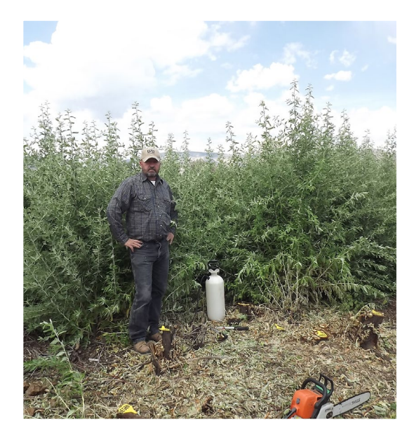
Figure 2. Sprouts from stumps of Russian olives that were cut down 4 months earlier.

rapidly (Fig. 2). Trees removed during the winter dormant season will reinitiate growth when conditions later become favorable (Patterson et al., 2018). Adventitious buds develop from meristematic tissue in places where buds are not normally produced (e.g., the cambium). All root suckers grow from adventitious buds, and the cambium layer of stumps can also produce adventitious buds after the tree crown is removed. Shoots arising from adventitious buds typically do not appear for 3 or more months after trees have