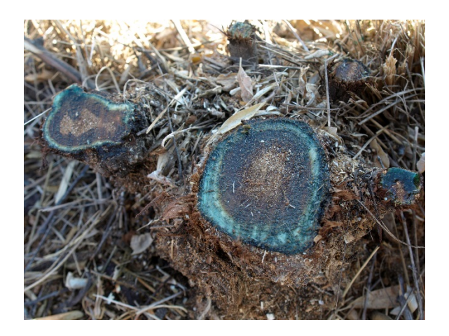
Figure 6. The cambium is the growth area that produces annular rings in woody plants. It is the area where almost all the water and food translocation takes place.

Unlike poplars, which can send up suckers from roots several inches deep, Russian olives sucker only from roots that are exposed or very shallow (Fig. 7). In a cut stump herbicide study where there were no exposed roots, suckers did not emerge from either treated or untreated stump roots (Patterson et al., 2018). In a similar Montana study,