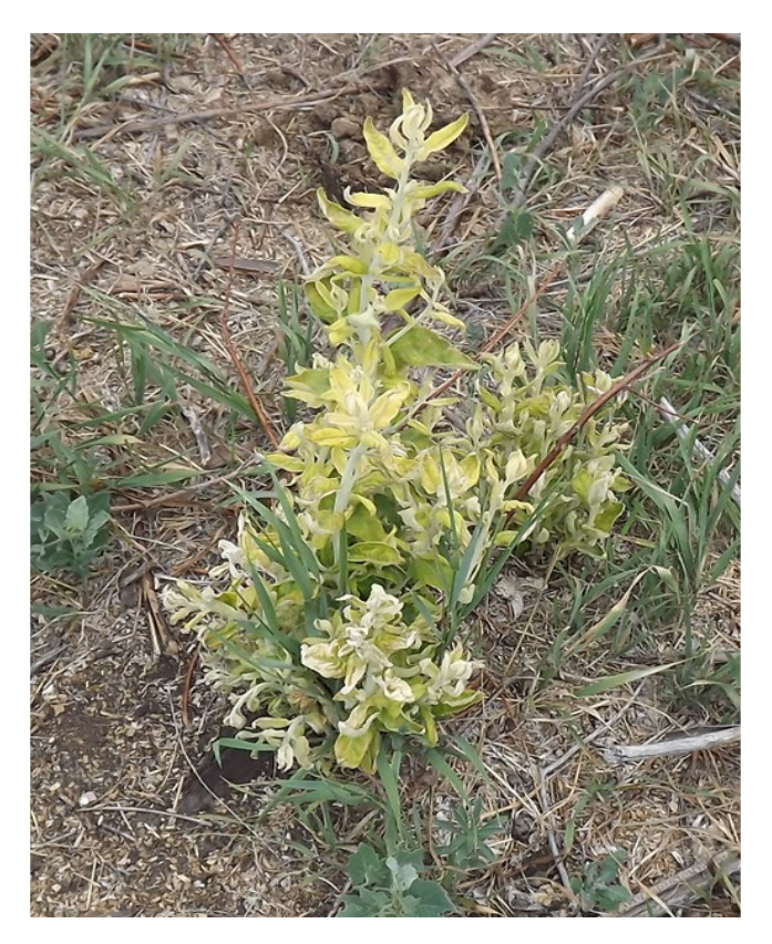
Figure 9. Herbicide damage symptoms on a Russian olive root sucker after the attached stump was treated with glyphosate.

root sucker control after trees are removed. Herbicide applied to cut stumps may be translocated to kill root suckers (Fig. 9), but may not provide complete control (Espeland et al., 2017). Multiple foliar or basal bark herbicide treatments are usually required to completely control root suckers.