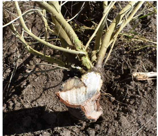
Figure 3. Cross section of an exposed Russian olive root. The suckers on the right grew from adventitious buds originating from the root's cambium layer.

been removed, since it takes that long for callus tissue (unspecialized cells) to form and new buds to develop (Fig. 3).