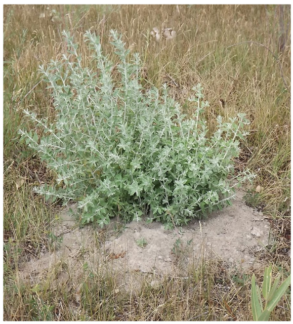
Figure 5. Regrowth from a Russian olive stump that had been buried.