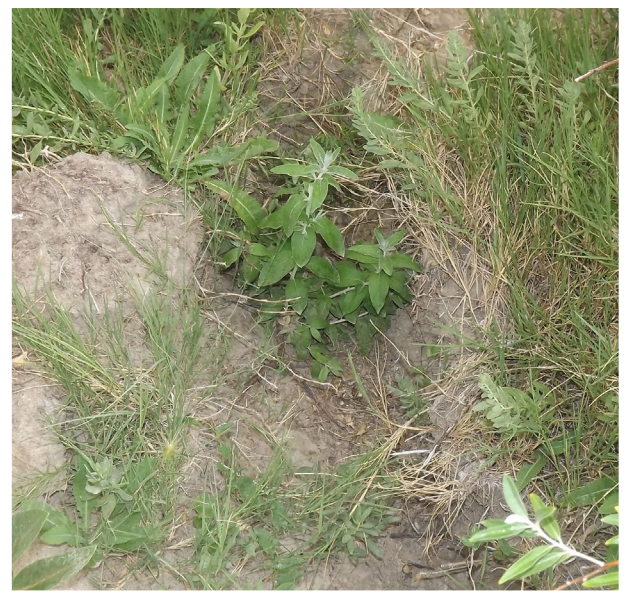
Figure 8. Russian olive suckers from a root exposed in an open trench.

total of one sucker from a small root that had remained unburied. In a similar study, trenches 16 inches deep were dug completely around nine Russian olive trees where every encountered root was severed. Half of each trench was backfilled to ground level, while the other half remained open. Twelve months later, an average of 25 suckers had emerged from exposed roots in open trench segments (Fig. 8). Almost all of the root suckers grew from roots that were no longer attached to the trees likely due to the trees' continued apical dominance that suppressed new shoot growth. A total of two suckers emerged from buried trench segments from two accidentally exposed roots. Two conclusions can be drawn from these results, coupled with observations of root suckers from undisturbed Russian olive trees: 1) Russian olives rarely produce root suckers unless roots are shallow or exposed, and 2) root suckering can be minimized by burying roots that are exposed by tree removal activities.