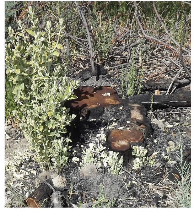
Figure 4. Regrowth from a Russian olive stump that had been burned.

cambium (Fig. 6) layer of freshly cut Russian olive stumps provided nearly 100% control of regrowth (Patterson et al., 2018).