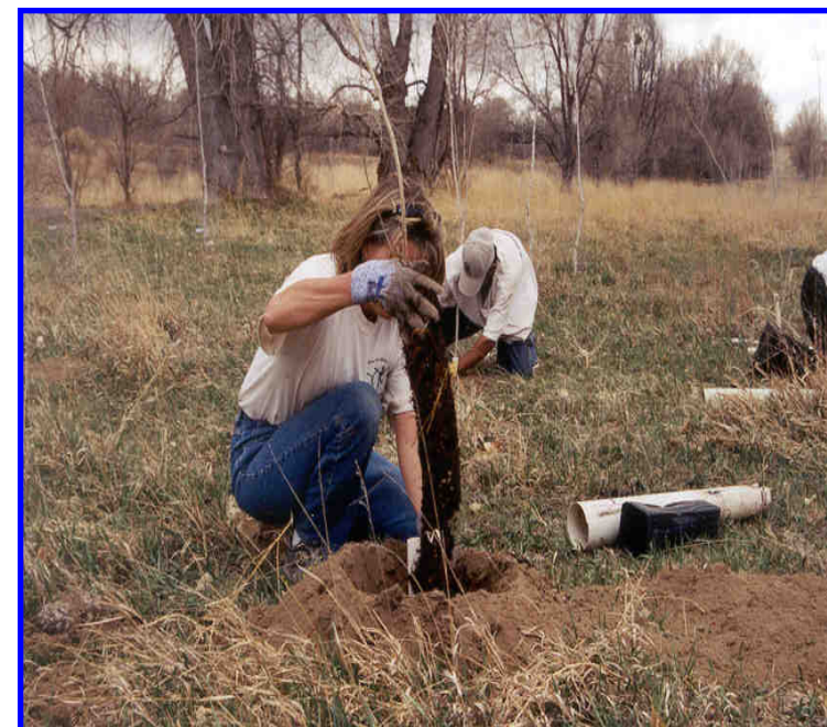
Inserting watering tubes into the planting hole next to the longstem plant

For additional information contact the Los Lunas Plant Materials Center at (505) 865-4684.