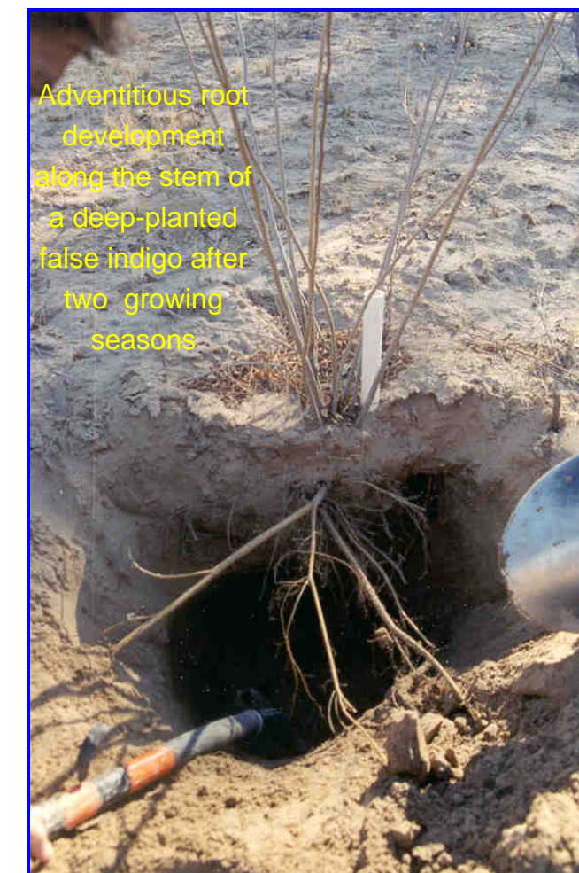
Adventitious root development along the stem of a deep-planted false indigo after two growing seasons