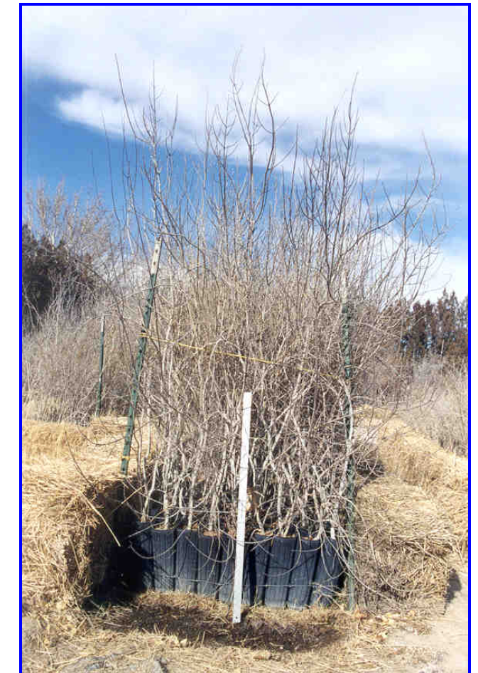
New Mexico olive longstem stock in one-gallon treepots