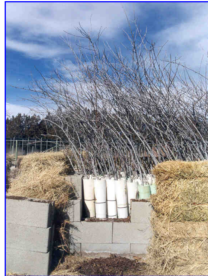
Golden currant grown in 30-inch deep tallpots

As soon as it became apparent that deep planting of longstem planting stock might hold promise for improved establishment on sites with deeper water tables, the LLPMC tested the same procedure with one-gallon treepot (4"x4"x14") longstem stock. The expense and inconvenience of producing 30-inch tallpots makes treepots an attractive alternative stock type. Longstem treepots of the