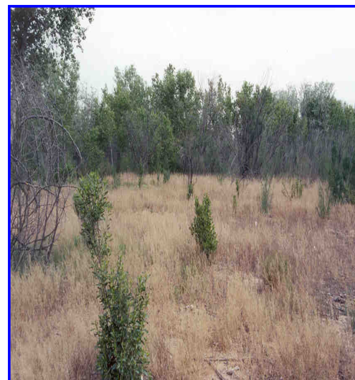
False willow established using deep-planted stock