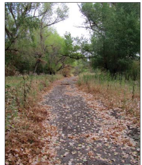
Figure 1. Cottonwood leaf drop at Tumacácori NHP along the dry bed of the Santa Cruz River, July 1, 2013.

The Santa Cruz River is an effluent-driven system, with most of its surface water provided by the NIWTP, in Arizona. In 1951, the plant discharged around 1.6 million gallons/day (mgd). Over the decades, that amount increased steadily as the international population it serves expanded. The