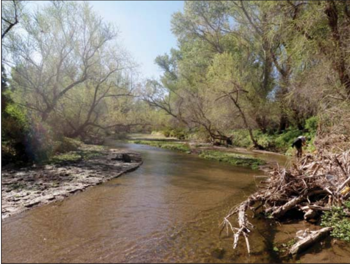
Santa Cruz River upstream of Santa Gertrudis Lane in 2012, flowing at approximately 12 cubic feet per second.