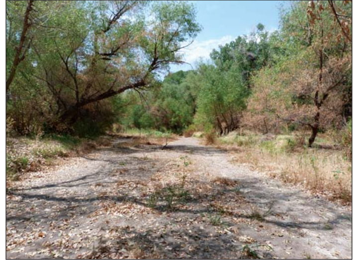
Santa Cruz River north of Santa Gertrudis Lane, July 3, 2013.