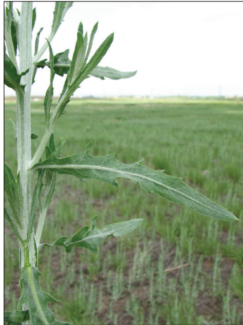
Figure 2: Russian knapweed shoot and leaves; note hairs and lobed leaves.