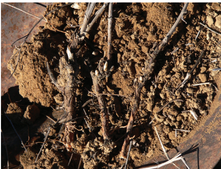
Figure 5: Russian knapweed root buds on crowns in fall; note black/brown scaly appearance to root crowns—a key identifying characteristic.

Russian knapweed grows in most western states. In Washington, it is common on heavier, often saline soils of bottomlands and grows in pastures, hayfields, grainfields and irrigation ditches. In Colorado, Russian knapweed is not restricted to certain soils and occurs in pastures, agronomic crops, roadsides, waste places and rangeland. Stands may survive 75 years or longer.