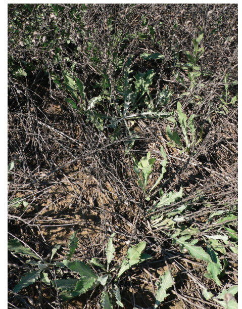
Figure 6: Russian knapweed emerged rosettes in fall.

Russian knapweed is controlled by Tordon 22K (picloram), Milestone (aminopyralid), Transline (cloprialid), Curtail, (cloprialid + 2,4-D), Perspective (aminocyclopyrachlor + chlorsulfuron), and Telar (chlorsulfuron). Refer to Table 1 for rates and timing recommendations and always read the herbicide label before using the product. Russian knapweed is very susceptible to fall-applied herbicides. It displays a distinct cycle of root bud development. In late summer (August into