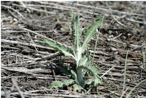
Figure 1: Russian knapweed rosette emergence in early spring.

Russian knapweed ( Acroptilon repens ) is a creeping, herbaceous perennial of foreign origin that reproduces from seed and vegetative root buds. Shoots, or stems, are erect, 18 to 36 inches tall, with many branches. Lower leaves are 2 to 4 inches long and deeply lobed (Figure 1). Upper leaves are smaller, generally with smooth margins, but can be slightly lobed (Figure 2). Shoots and leaves are covered with dense gray hairs. The solitary, urn-shaped flower heads occur on shoot tips and generally are 1/4 to 1/2 inch in diameter with smooth papery bracts. Flowers can be pink, lavender or white (Figure 3). Russian knapweed has vertical and horizontal roots that have a brown to black, scaly appearance, especially apparent near the crown.