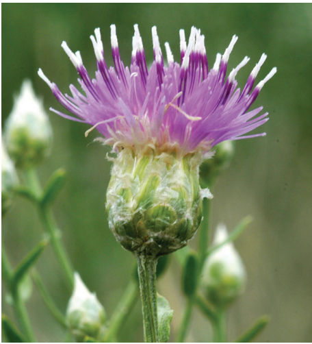
Figure 3: Russian knapweed flower; note smooth papery bracts that lack any spines.