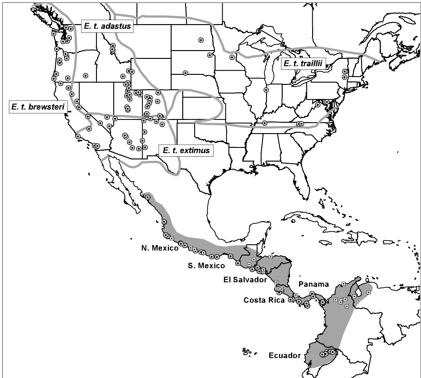
FIGURE 1. Locations of Willow Flycatchers sampled for molecular genetic information on the breeding and winter grounds (circles) and locations of museum specimens identified to subspecies on the winter range (squares). Gray lines, outlines of subspecies' breeding ranges; shading, the Willow Flycatcher's known winter range.

200 \mu M deoxynucleotide triphosphates (dNTPs), 1 \mu M of each primer, and 1 unit of Taq DNA polymerase. Conditions of cycling were as follows: 35 cycles of 30 sec at 94 ^{\circ} C, 30 sec at 55 ^{\circ} C, and 2 min at 72 ^{\circ} C. PCR products were concentrated with a QIAquick PCR purification kit (Qiagen), then sequenced on an ABI 377 DNA sequencer. We aligned the sequences manually and edited them with Sequence Navigator version 1.0.1 (Applied Biosystems). All unique cytochrome b sequences were deposited in GenBank (accession numbers AF297237–AF297276, GU207885–GU207935).