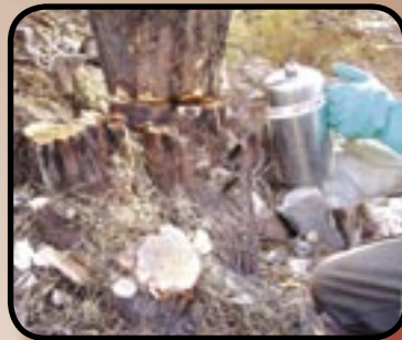
Cut stump application

Triclopyr and imazapyr are effective herbicides against saltcedar. Triclopyr is most effective in cut stump and basal bark treatments. Trees should be cut so that the stumps are two inches above the soil surface and the herbicide should be applied within a few minutes to the sides of the stump and the cambium layer. Basal bark applications can be applied any time of the year when the bark isn't wet or frozen. Herbicide should be applied from the ground up to 12-18" on all sides of the stem. Imazapyr treatments are most effective as foliar applications and provide the highest rate of saltcedar mortality at levels of 90 percent or greater. Fall applications in August or September produce the highest mortality rates.