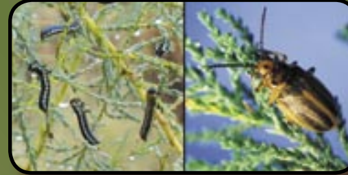
D. elongata pupae and adult

The saltcedar leaf beetles are yellow-brown and about ¼ inch long. Larvae feed on saltcedar foliage for about 3 weeks before crawling or dropping to the ground where