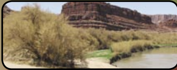
D. elongata feeding damage

The extensive invasion of saltcedar has justified the search for a suitable biological control agent. The saltcedar leaf beetle, Diorhabda elongata , has been tested for 20 years by APHIS and has been released at test locations in the western United States. At these test sites, it was demonstrated